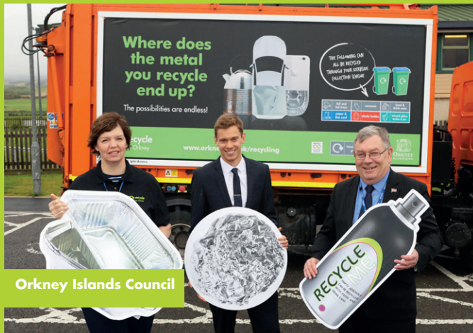
Orkney Islands Council