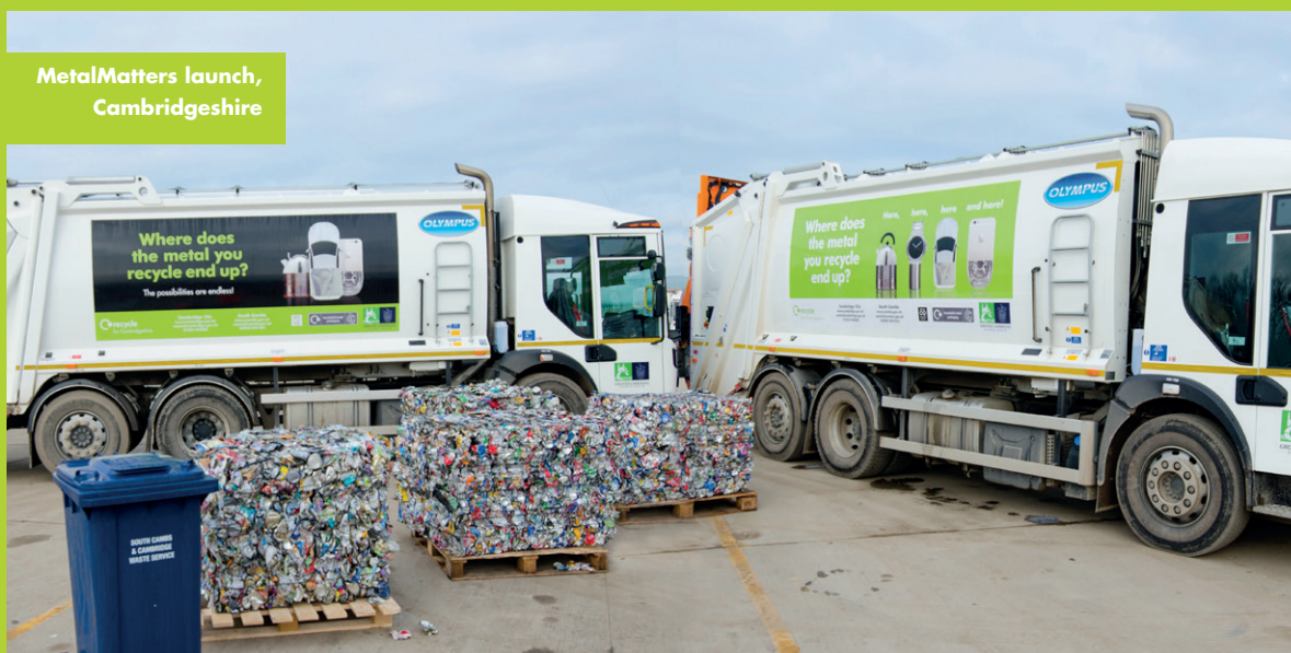
MetalMatters launch, Cambridgeshire

In addition to the two leaflets, MetalMatters offers an extensive resource of template materials. Depending on available budget, local authorities can adapt and incorporate these materials to create a locally-focused campaign.